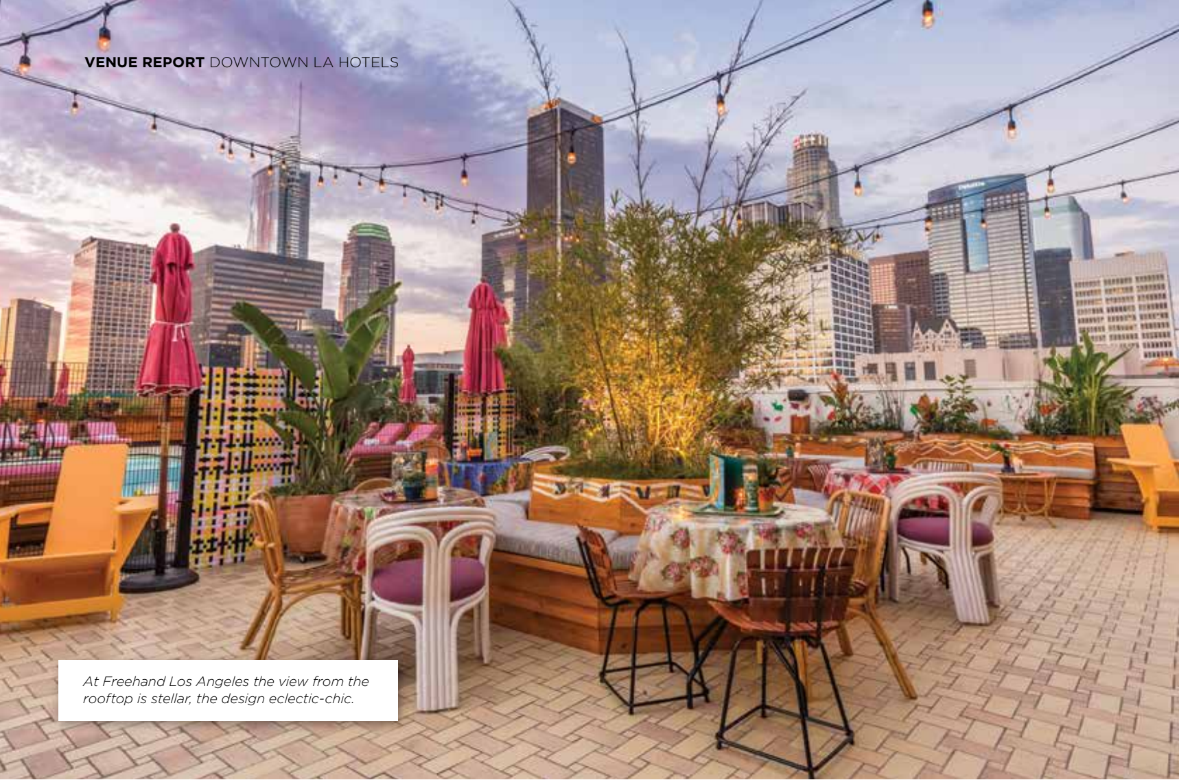
At Freehand Los Angeles the view from the rooftop is stellar, the design eclectic-chic.